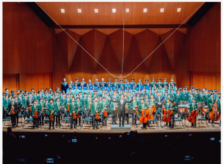
Annual Concert 2026 - Inizio on 16 th May 2026.