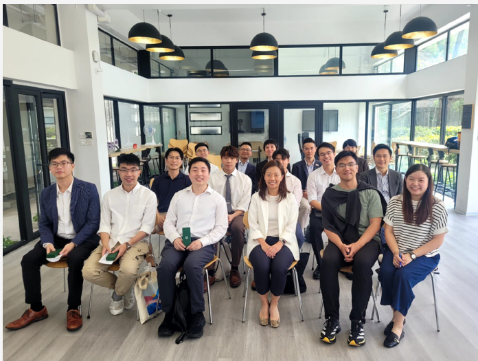
Career sharing on 11 th May 2026.

這次會議帶來深刻的省思：它不僅推動了執行與規劃，更成為凝聚不同個體的強大催化劑，突顯了耶穌會教育網絡內部連結與共同目標的力量。