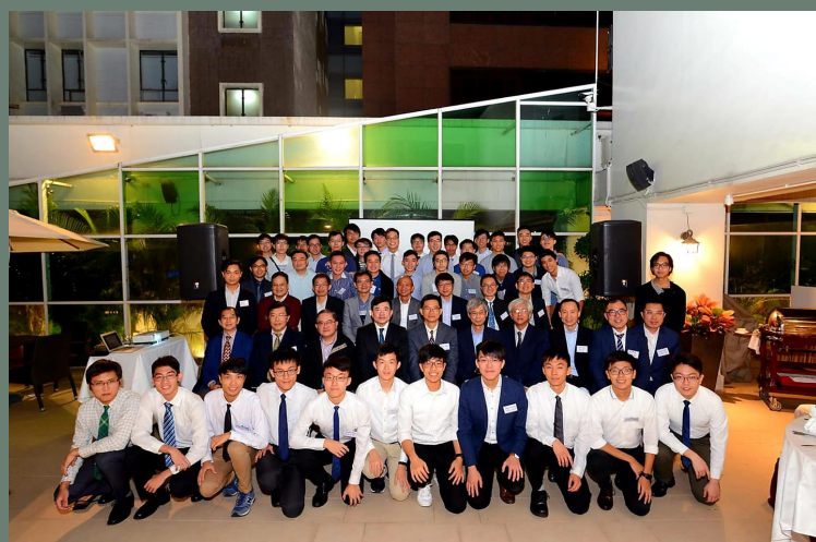
WYK Medical Fraternity dinner at 2018

Please spread the news to other WYK and WYHK medical alumni.