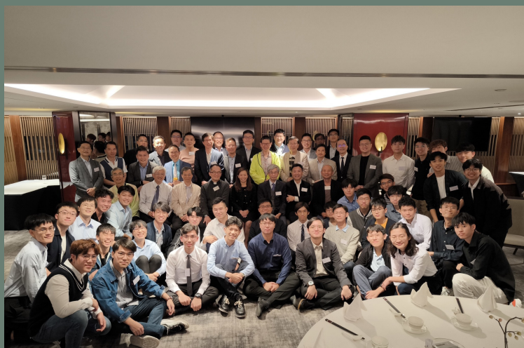
WYK Medical Fraternity dinner at 2023, the first one after Covid-19