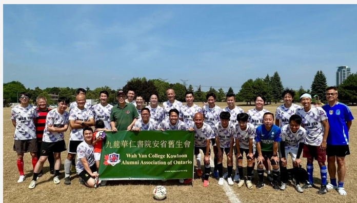
WYKPSA Ontario Chapter Joint-School Soccer Fun Day took place in August 2025.