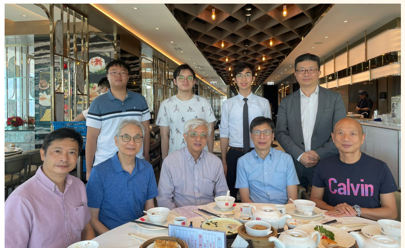
Tea meeting on 3 August 2023