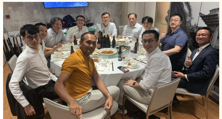
Wah Yan Sailors wine tasting dinner on 17 August 2023