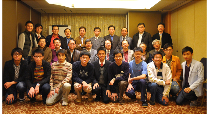
Dinner 2009 - First dinner of the medical alumni