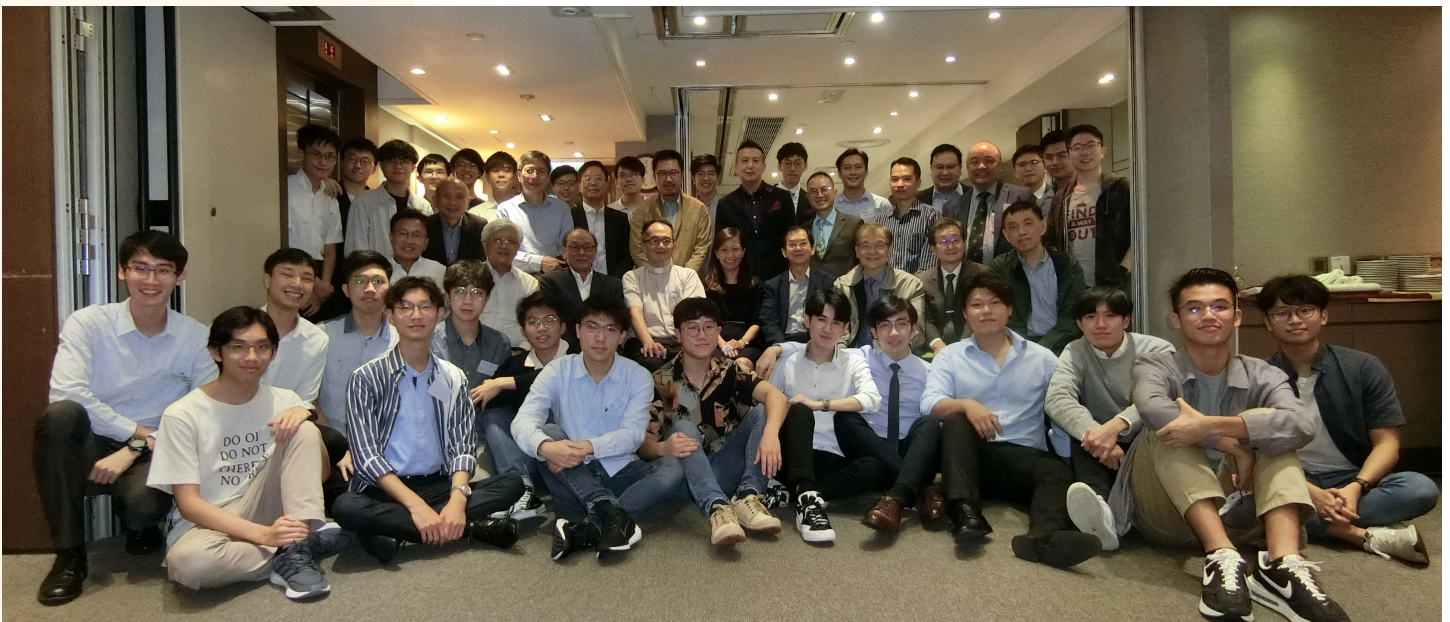
Dinner 2022 - WYK Medical and Dental Alumni Dinner 29 November 2022