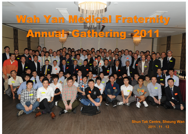
Dinner 2011 - First joint dinner with WYHK 12 November 2011