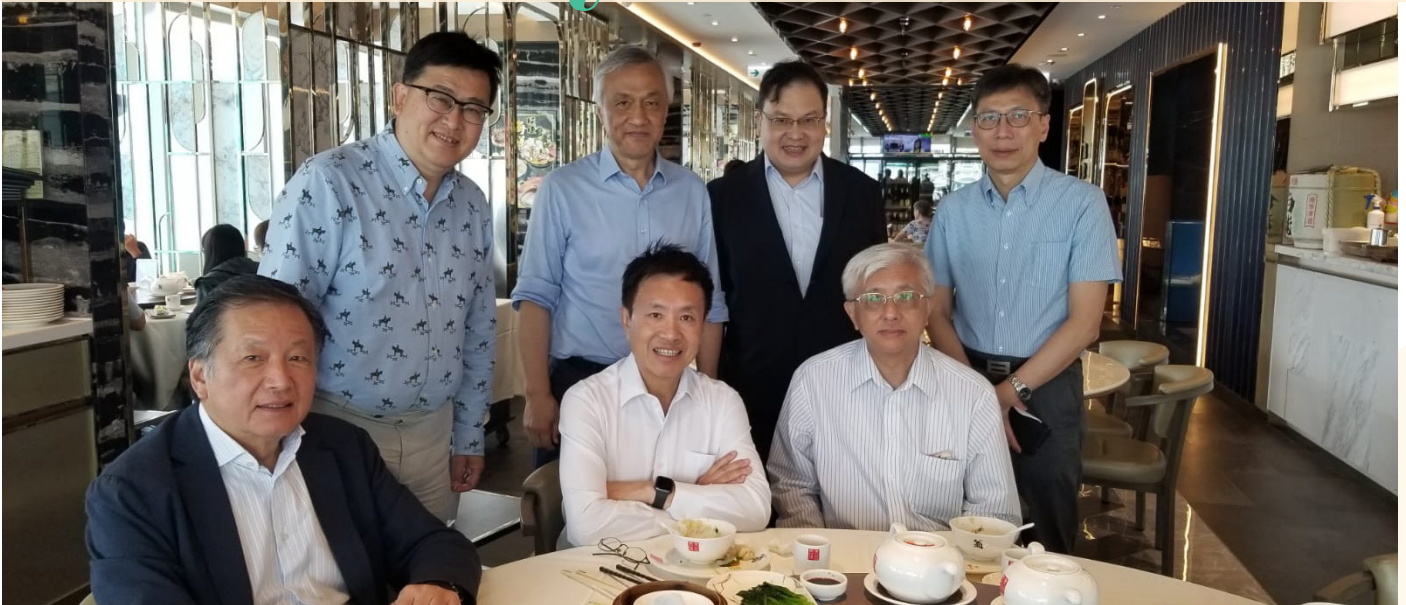
Tea meeting on 6 July 2023