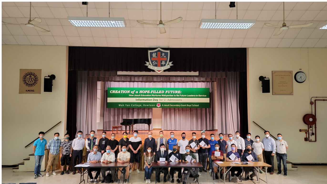
Taking a group photo in the School Hall after the successful Annual General Meeting on 29 May 2021.