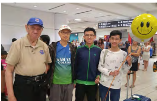
Photo: Top right - Student Ambassadors on arrival at Toronto.