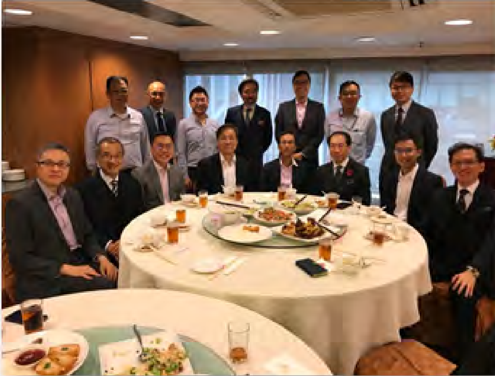
WYK legal fraternity lunch on 31 October 2019.