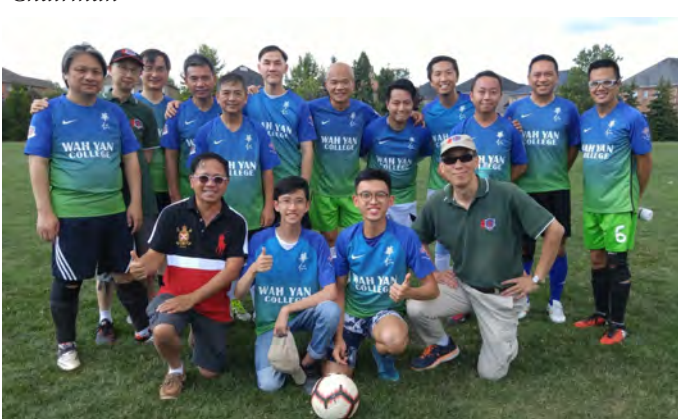
Photo: Student Ambassadors joining WYKAAO Picnic 2019 and a football match between Wah Yan and La Salle alumni.