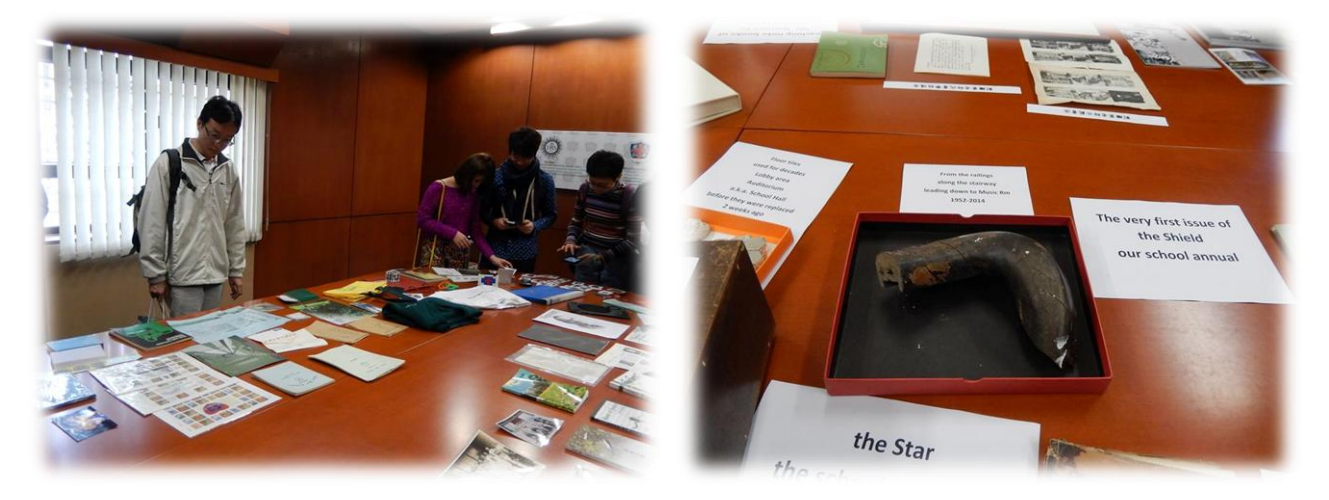
The "History Path" Exhibition