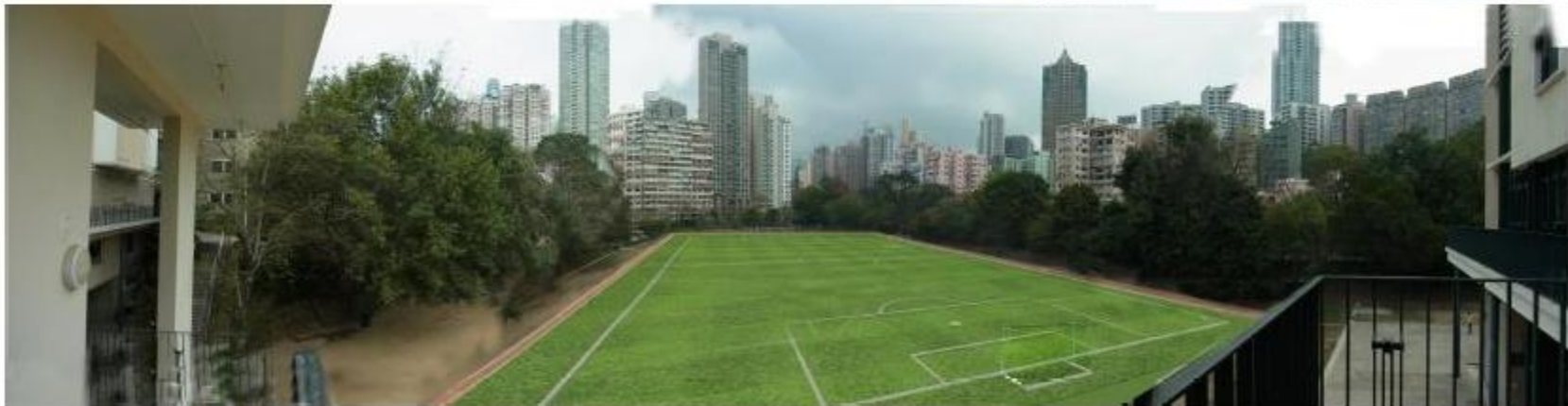
PROPOSED NEW FOOTBALL FIELD