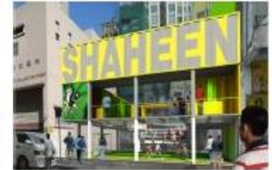
PREVIOUS RELEVANT PROJECT