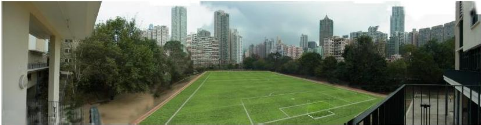
PROPOSED NEW FOOTBALL FIELD