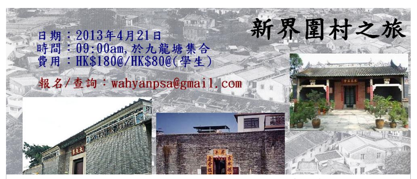
WYKPSA is going to organize a tour to the walled villages in the New Territories (新界圍村之旅), please find details as follows:

Date & Time: 21 April 2013 (Sunday) 9:00 am – 5:00 pm