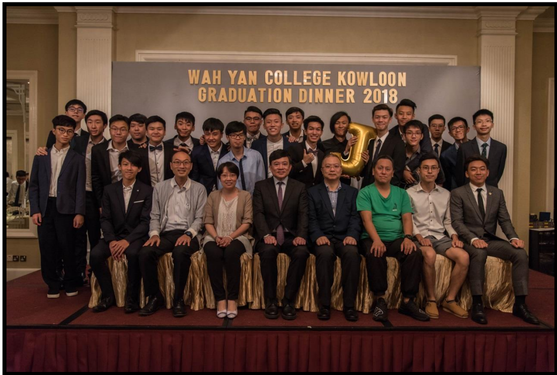
A photo speaks more than a thousand words: Students expressing gratitude to teachers and Principal.