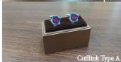
Cufflink Type A