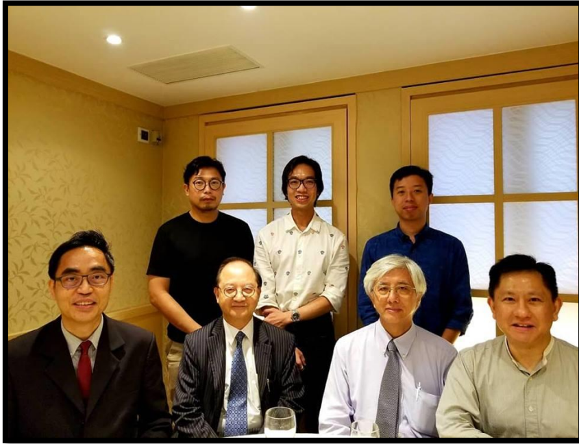
From Class 70 to Class 03: Different generations of alumni connected!