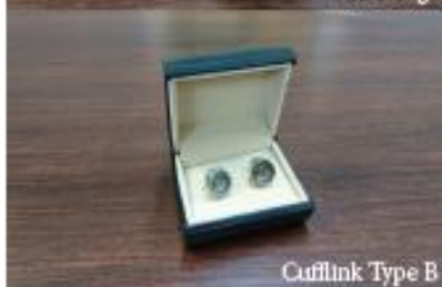
Cufflink Type B