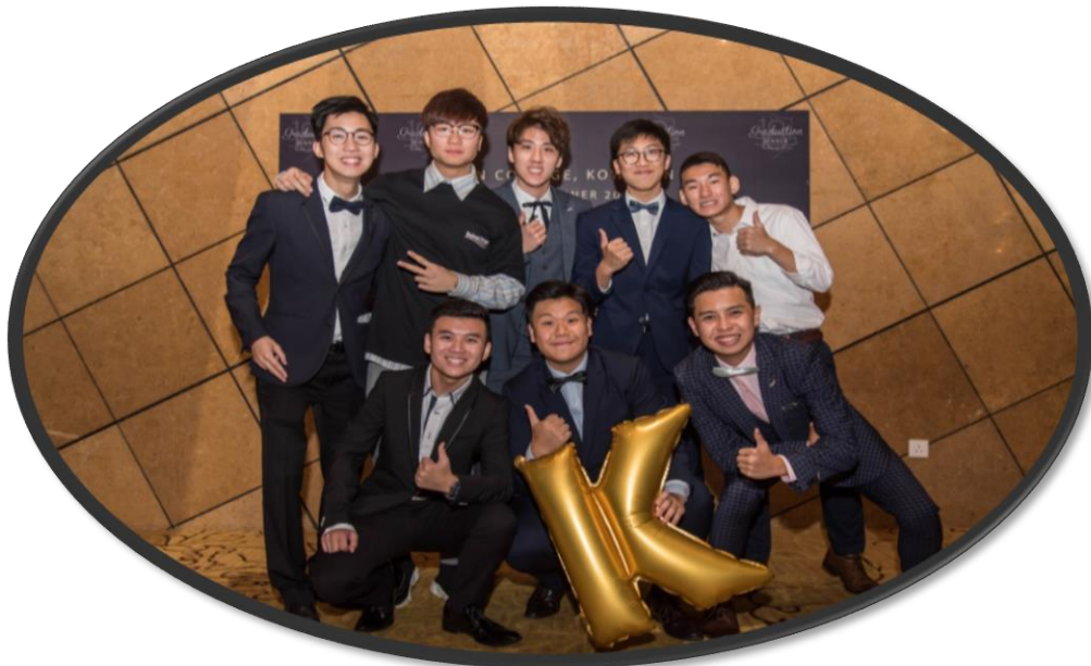
F.6 students enjoying happy moments. A question: which class are they belonging to?