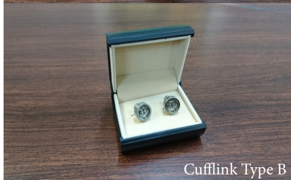
Cufflink Type B