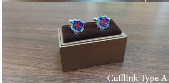
Cufflink Type A