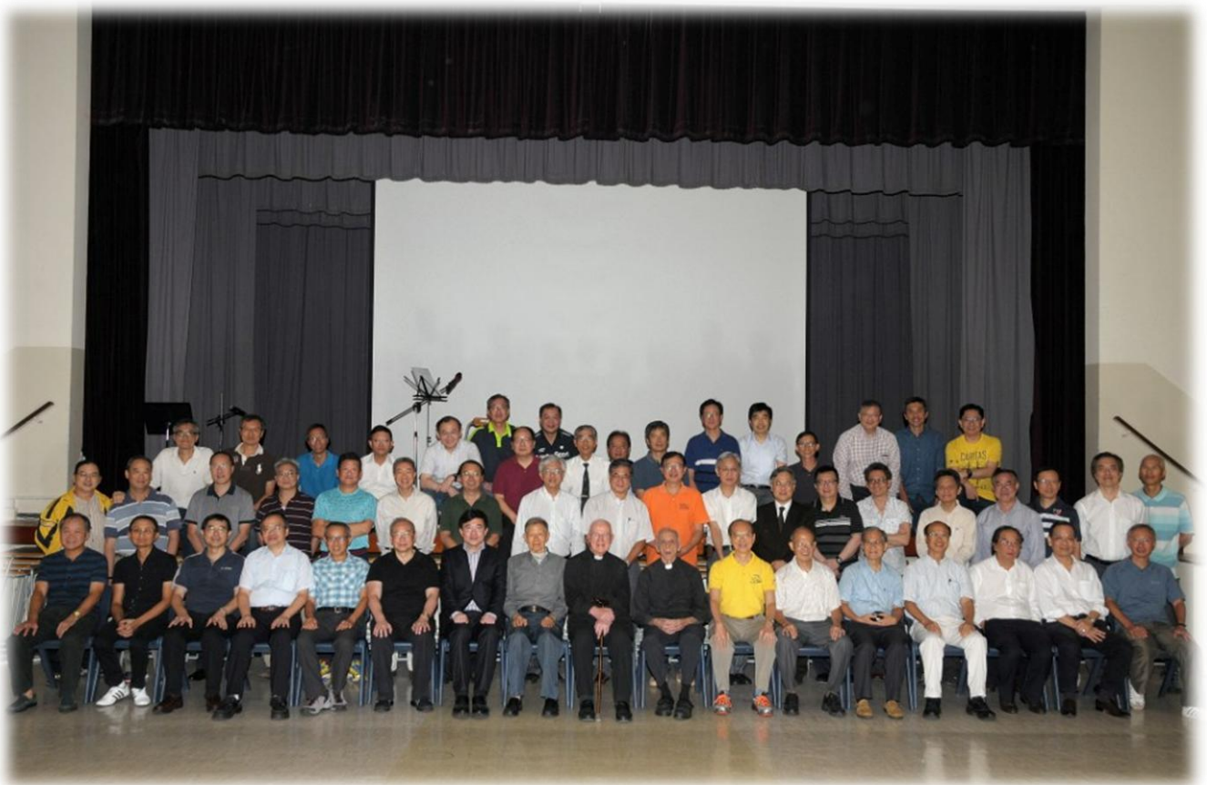
Reunion of Class 1975 - 19 Sept 2015