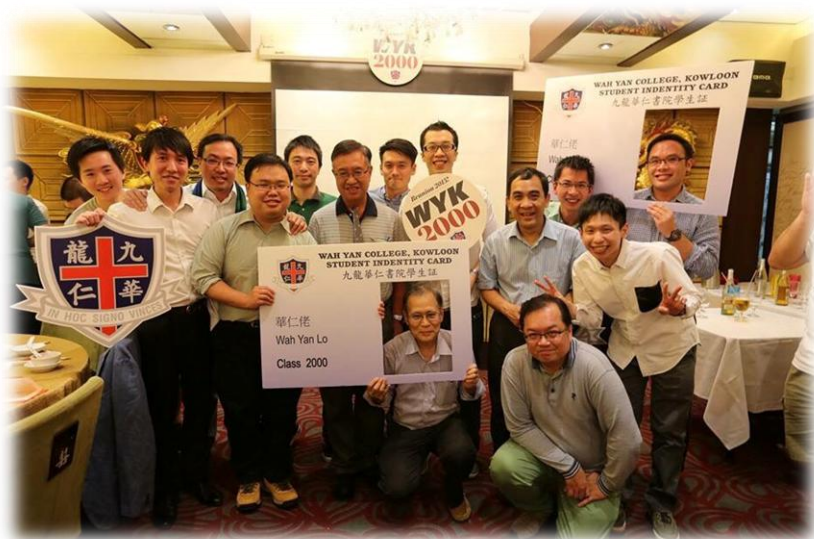
Reunion of Class 2000