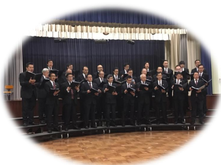
The Old Boys Choirs of Wah Yan College Kowloon and Diocesan Boys' School