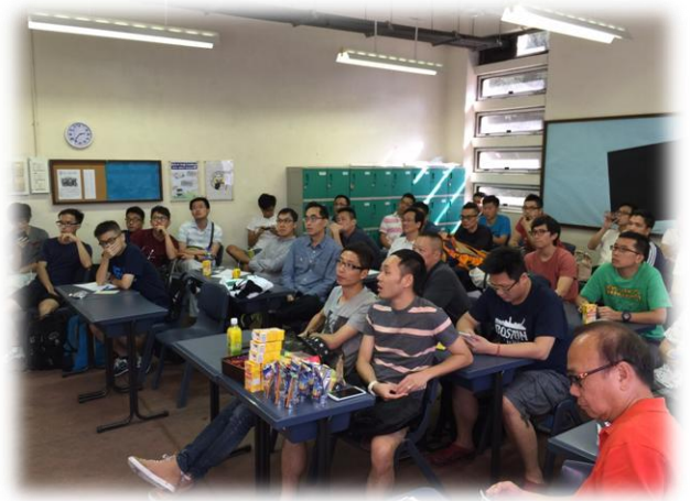
Captain's Meeting on 31 October 2015

The 17 th Wah Yan League Football Tournament has kicked off! We have 33 teams from WYK & WYHK participating this year.