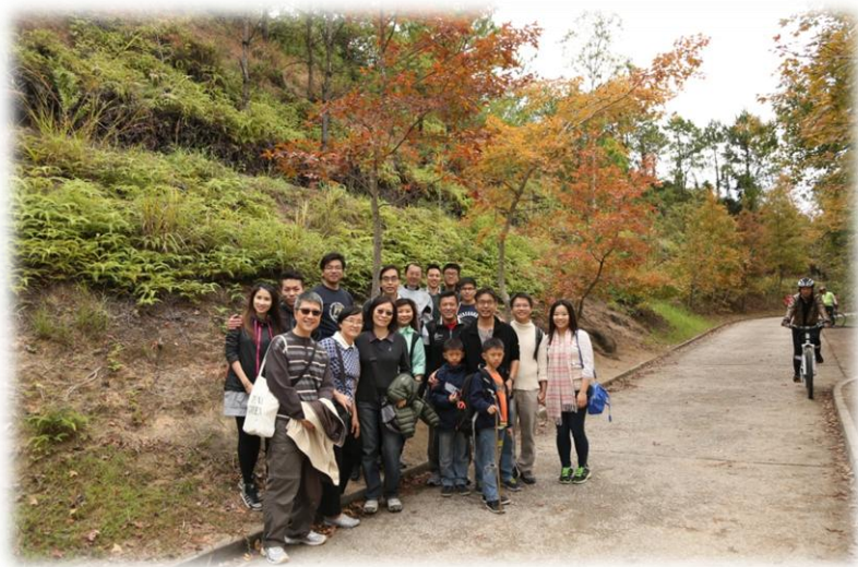
WYKPSA Hiking Interest Group 大棠楓葉林 – 6 December 2015

If you are interested in joining any Fraternity or Interest Group, please contact us at wahyanpsa@gmail.com . All are welcome!