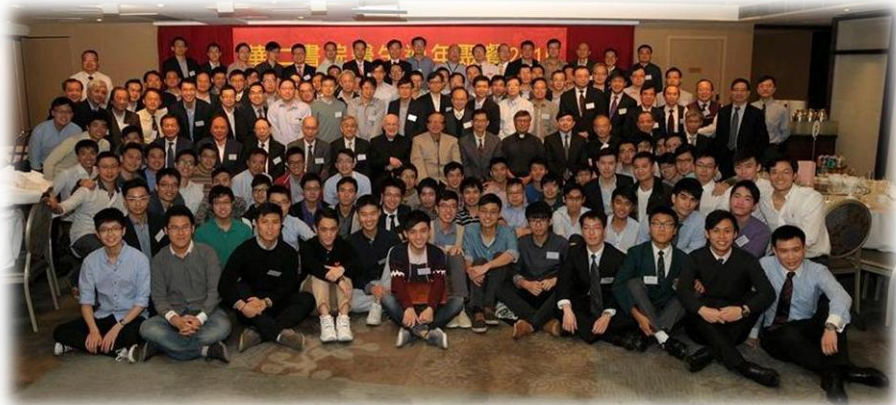
Wah Yan Medical Fraternity Annual Gathering – 2 December 2015