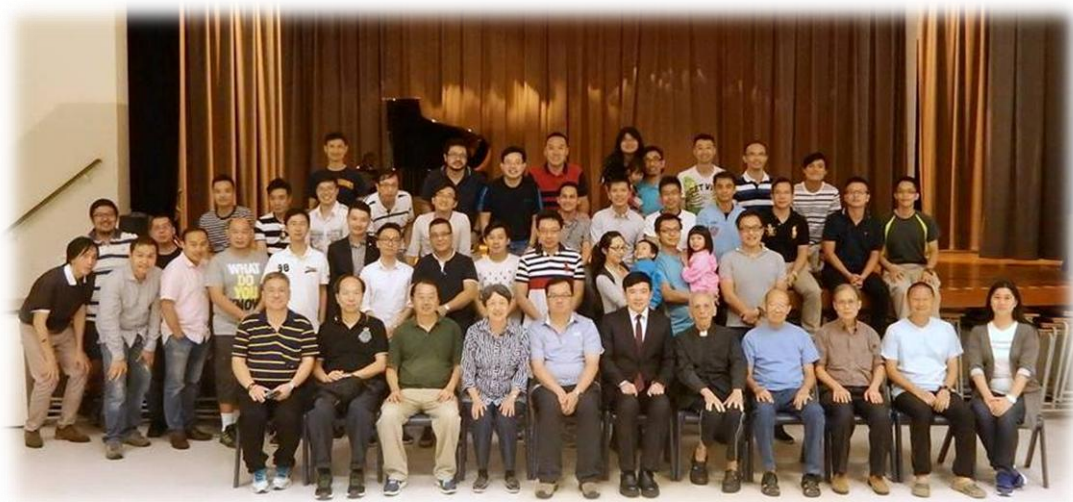
Reunion of Class 1995