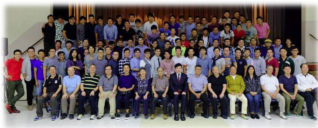
Reunion of Class 2005