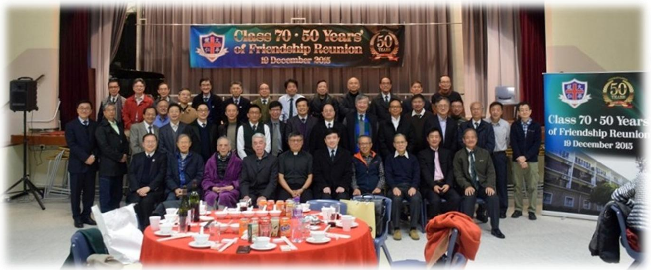
Reunion of Class 1970 - 19 Dec 2015