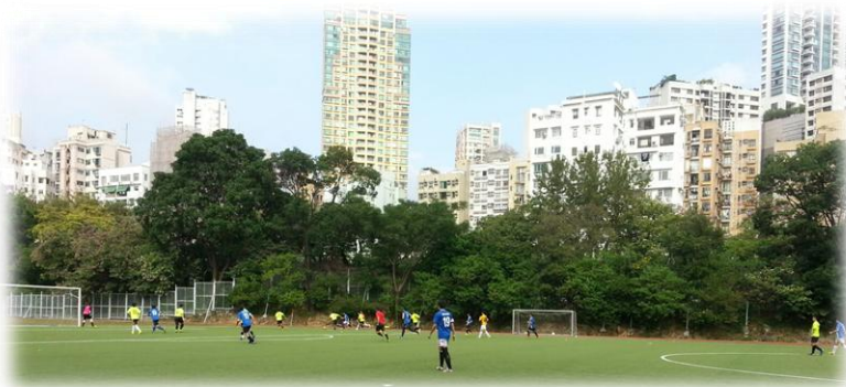
The first match on 14 Nov 2015