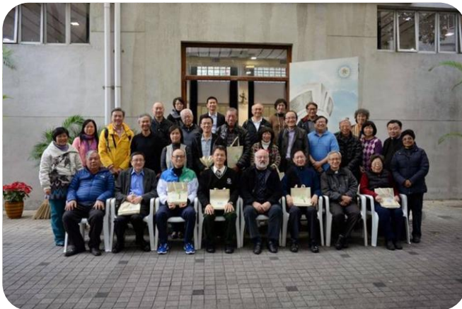
Visit to Heritage of Jesuits in Macau Day 2

The 2014 Wah Yan International Conference was held in a distinguish way this year, with a three-day event spanned across three locations instead of one single venue. The Conference set its reception in the newly renovated school hall of WYHK on 5 th December with day trips to Jesuits establishments in Macau & Yim Tin Tsai on 6 th & 7 th respectively.