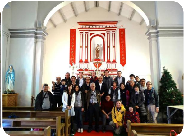
Visit to Yim Tin Tsai Day 3