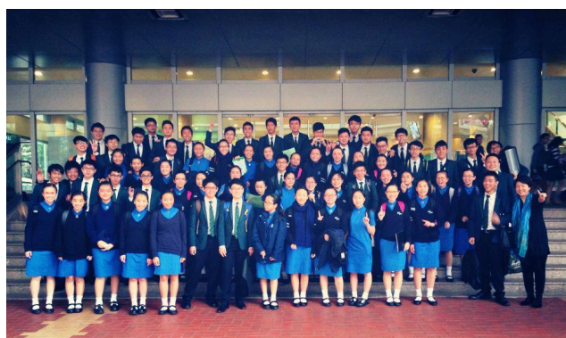
Congratulations to our Senior Mixed Choir which was awarded Championship at the 66 th Hong Kong Schools Music Festival Competition!