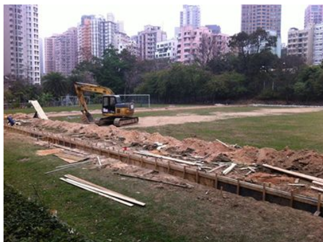
Works going on!