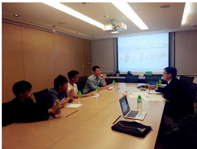
The first workshop on job interviewing skills and CV preparation was successfully held in late August 2013.

All are welcome! We look forward to seeing you there!