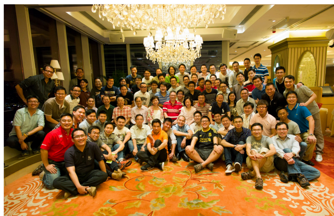
WYK Reunion 1 Sept 2012